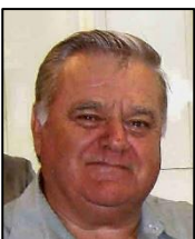
Sambo – The People's Champion

This year we have the down-stairs restaurant which will make it a lot easier for our older members and we're going to share it with 3 Sqn and 9 Sqn. If you're not able to march, you are most welcome to come to the after-March function to meet and be with your mates – and, if you're a Vietnam Vet – we'll have a surprise for you.