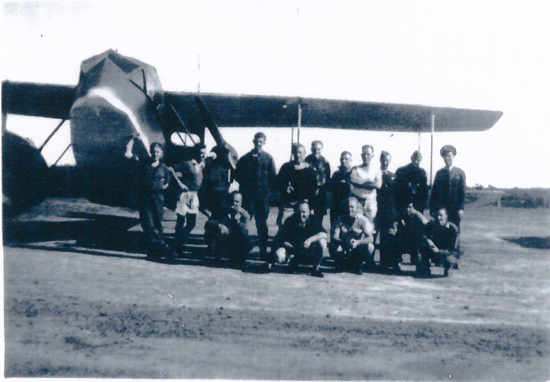
Albany, 1942

The photograph below is of our Dragon at Albany where the Squadron was supporting work associated with calibrating radio equipment.