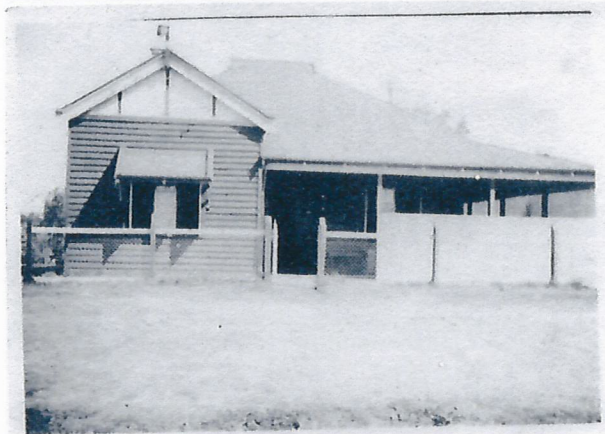
Maylands, 1942

Facilities for the Squadron at Maylands were fairly limited. The house pictured here was used for staff quarters – officer and enlisted men. The front room was the office.