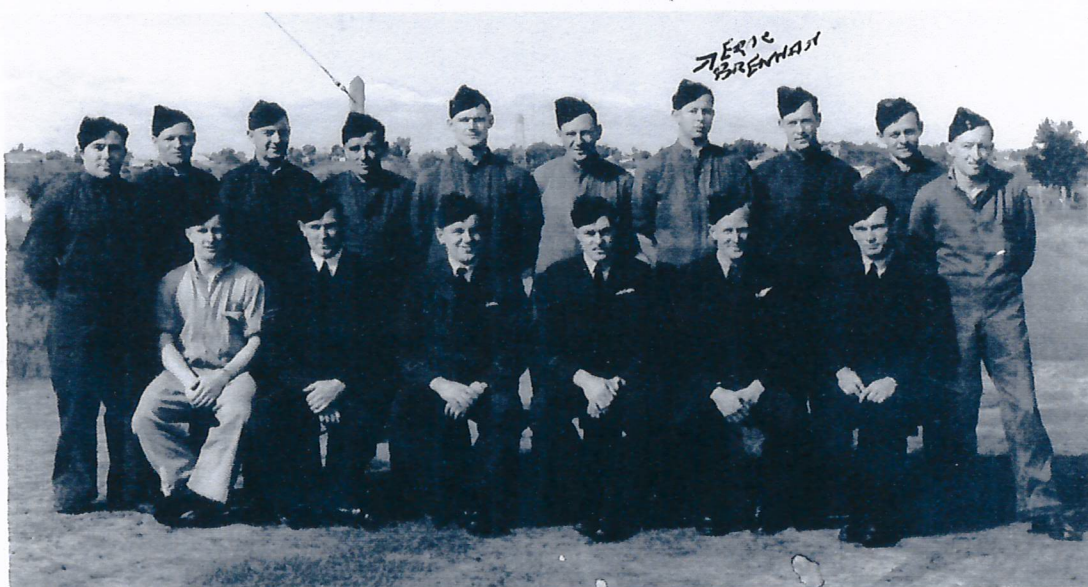
35 Squadron, Maylands, July 1942