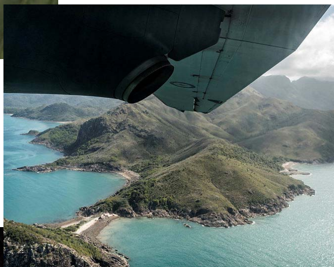
Right The north Queensland coastline from a C-27J Spartan aircraft during Operation Resolute.