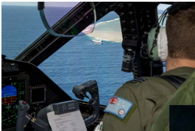
Left FLTLT Ben Calman, conducts a low level rigging run in a C-27J Spartan to observe a small vessel on the Great Barrier Reef during Operation Resolute in Townsville.