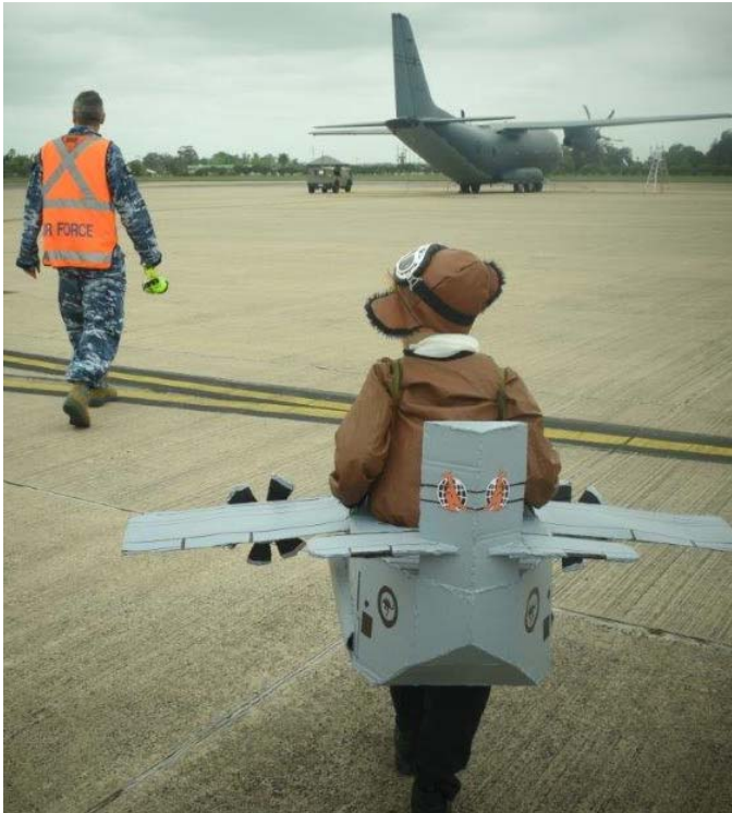
Left WGCDCR Ben Poxon shown left of photo, Marcus Power shown right of photo in C27J Spartan Wakakirri Plane Prop on 25 Oct 18.

"Our item tells a story of the history of the fertile local area and the beautiful Hawkesbury river. Beginning with the Indigenous people who lived along the river banks up to present time we dance the story of how it has changed and become a unique and beautiful place to live".